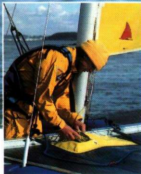
It's good to see reefing points for this boat, and even better to see the system working so well.

The tramp bag zips up to prevent halyards getting in the way. Note the useful 6:1 downhaul and the jibsheet blocks which can be adjusted inboard and outboard.