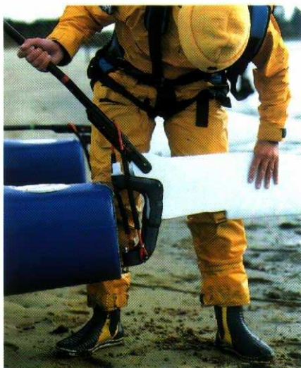
Dart's new rudder system uses a simple rubber band as a locking mechanism...