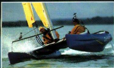
Wild Thing?! The 16 is perfect for learning this daft, but fast technique.

The tramp bag zips up to prevent halyards getting in the way. Note the useful 6:1 downhaul and the jibsheet blocks which can be adjusted inboard and outboard.